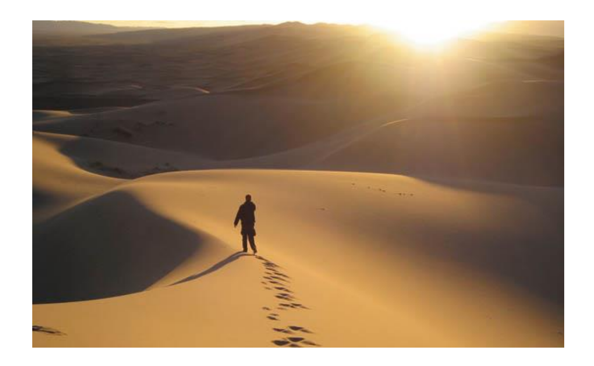
Vs 4-5 Some wandered in dessert wastelands, finding no way to a city where they could settle. They were hungry and thirsty, and their lives ebbed away.